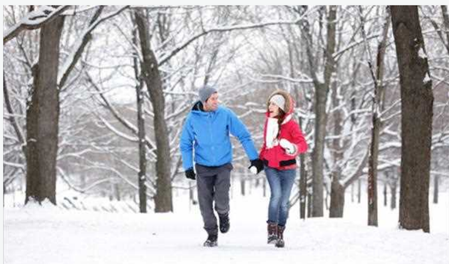
PheromonesSexual AttractionAttract WomenPheromone ProductSeductionAndrostenoneSex